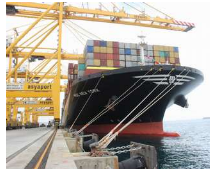
Harbor Vessel UPS