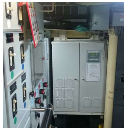
On Vessel UPS