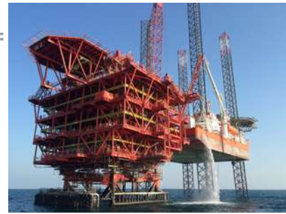
Petrol Platform Oil Ring