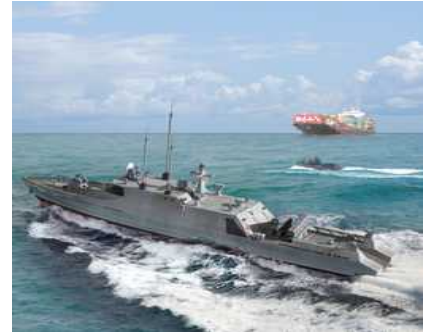
On Board Marine