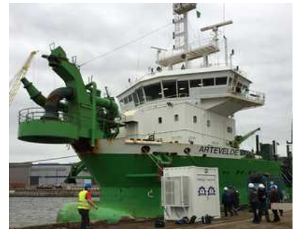
Harbor Power Supply