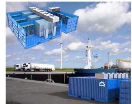
Harbor Port Zone